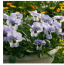
'Shangri-La Marina' Viola