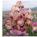
'Spanish Dancer' Sweet Pea