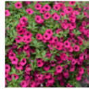
'Supertunia Sangria Charm' Petunia