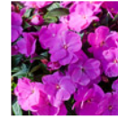
'Magnum Lavender' New Guinea Impatiens