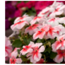
'Impreza Cherry Splash' Impatiens