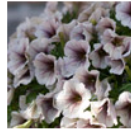
'Potunia Blackberry Ice' Petunia