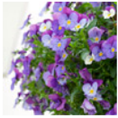
'Plentifall Lavender Blue' Pansy