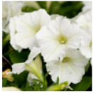
'Shock Wave Coconut' Petunia