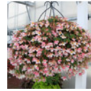
'Beaucoup White' Begonia