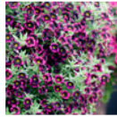
'Superbells Blackberry Punch' Calibrachoa