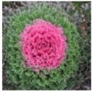
'Glamour Red' Kale