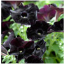
Black Velvet Petunia