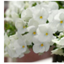
'Plentifall White' Pansy