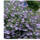
'Lucia Lavender Blush' Lobelia