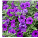
'Supertunia Indigo Charm' Petunia