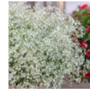
'Stardust White Sparkle' Euphorbia