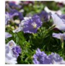
'Opera Supreme Light Blue' Petunia