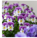
'Plentifall Purple Wing' Pansy